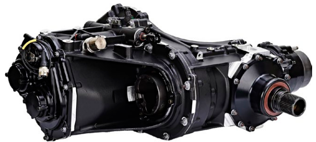
SADEV's ST4-917 gearbox

SADEV found that Romax's simulation capabilities gave them a very high-end solution that could provide extra design and development dimensions, in particular the detailed simulation of all gearbox and transmission system components such as gears, rolling bearings, transmission joints, lubrication, etc together as a whole system. This system-wide simulation allows, for example, the calculation of gear teeth deflections taking into account shaft bending and bearing misalignments.